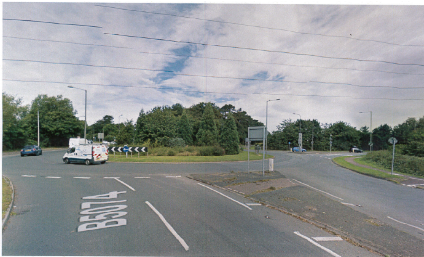
A51 (Nantwich Bypass) / B5074 (Barony Rd) Reaseheath Roundabout. Nantwich